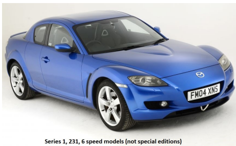
Series 1, 231, 6 speed models (not special editions)

A standard, UK 231 series 1 RX-8 may look like this: