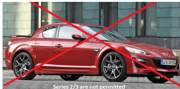
Series 2/3 are not permitted

You cannot use a later series 2 (R3) car: